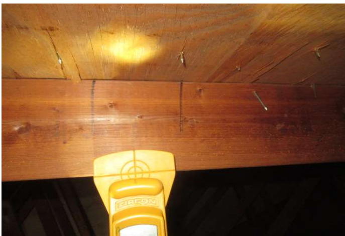
Nail location verified