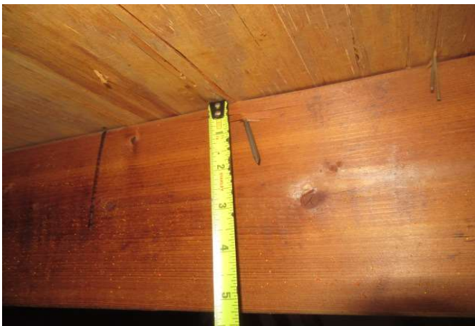
8d nails verified