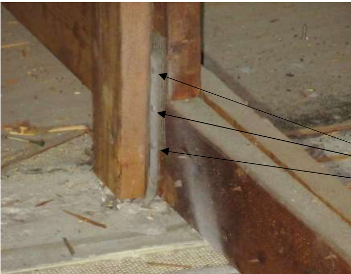
Single strap with at least 3 nails into the truss